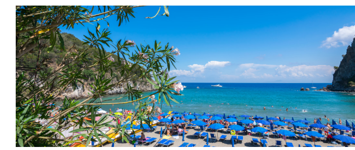
Girls Night Out: Island Hopping to Ischia Saturday and Sunday, May 14 and 15

$5 transportation fee, €60 euro for horse ride Spend the afternoon with Liberty from atop a horse in Vesuvius National Park. The tour is guided by a professional horseback riding company and includes all you need to enjoy the day. Bring snacks and camera.