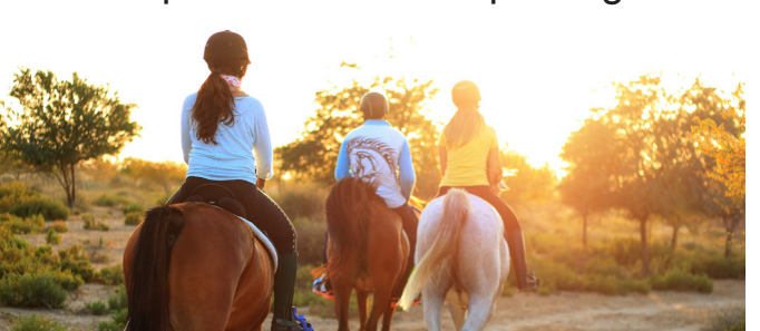
Horseback Riding Adventure Saturday, May 7, 9 a.m.-1:30 p.m.

Trips leave from the parking lots of the Liberty Center, Bldg. 2038 and Naval Hospital BEQ, Bldg. 2087, Support Site.