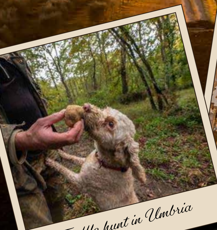
Truffle hunt in Umbria