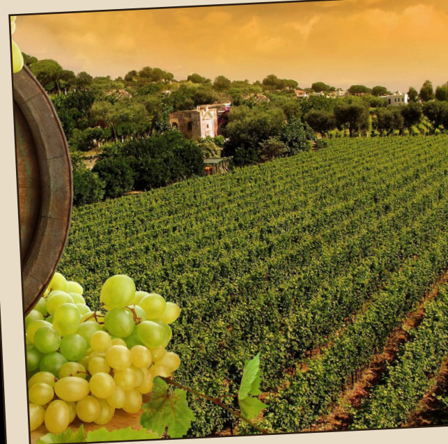
De Ricci Winery

For more information, call Tickets & Travel at Capodichino: 081-568-4330 / DSN 626-4330 Support Site: 081-811-7909 / DSN 629-7909