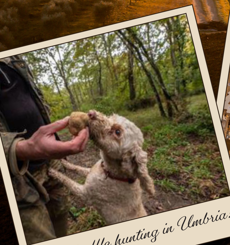
Enjoy truffle hunting in Umbria!