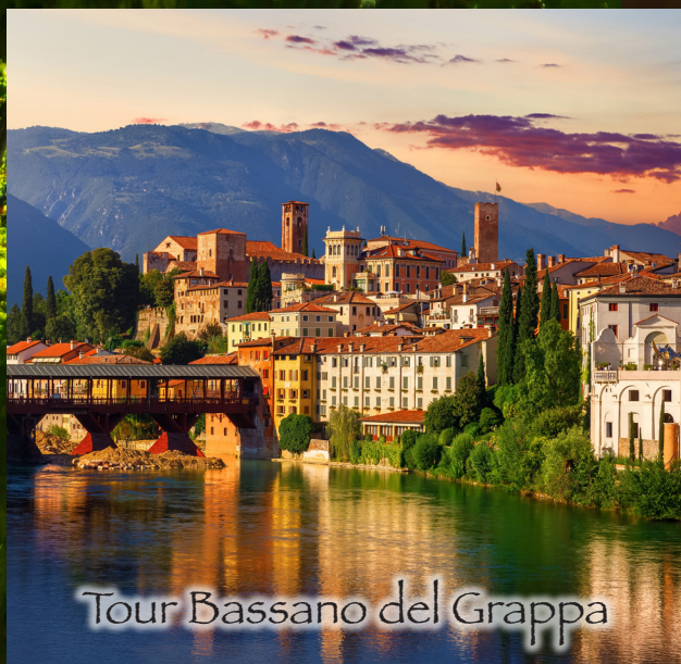
Tour Bassano del Grappa