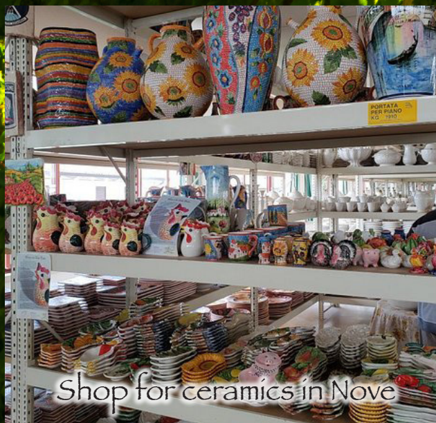
Shop for ceramics in Nove