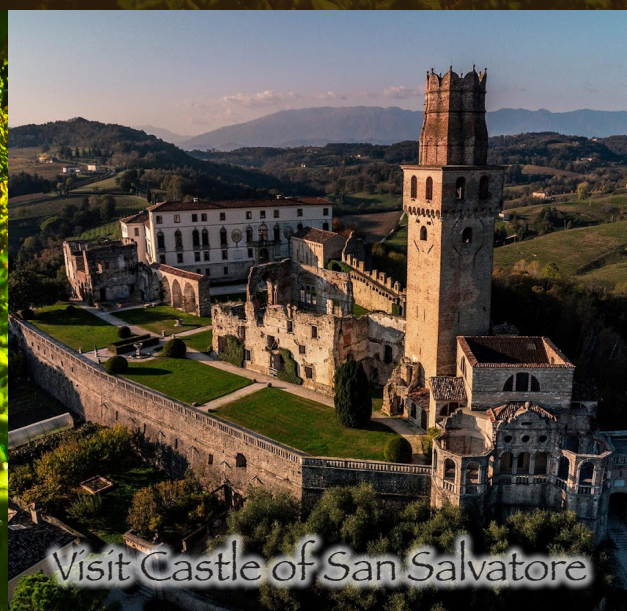
Visit Castle of San Salvatore

For more information, call Tickets & Travel Capodichino 081-568-4330 / DSN 626-4330 Support Site 081-811-7907 / DSN 629-7907